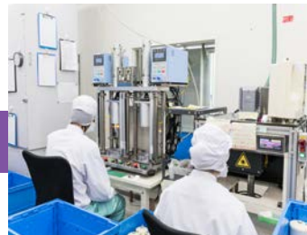
Production Department for cartridges.