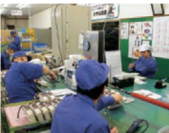
Electrolysis chamber assembly line.