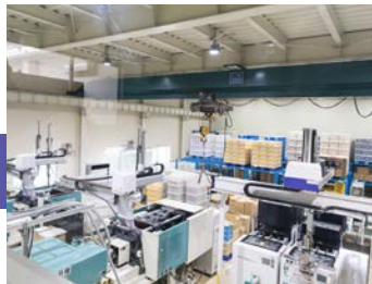
The latest injection molding machines.