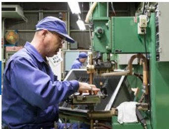
Press Processing Department for electrode plates.

The Osaka Factory is located in Hoshidakita, Katano City, in the northeastern part of Osaka prefecture. It is a large production facility covering over 43,000 square feet in both site area and overall floor space. The major components of our products, including everything from electrode plates to internal filters, are all made in our Osaka Factory. The factory adheres to the highest manufacturing standards and has earned numerous International Organization of Standardization (ISO) certifications, including ISO9001, ISO14001 and ISO13485.