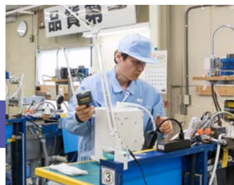
pH testing is also done during water flow testing on the completion line.