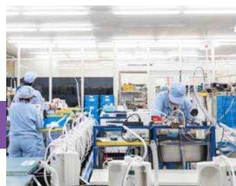
Main assembly line.