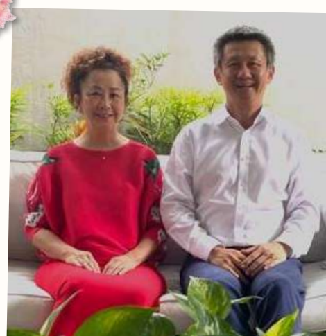
The only constant in life is change. Embrace new normals as we move towards a new future.