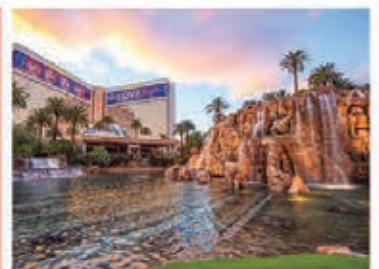
Held at the Mirage Hotel, Las Vegas