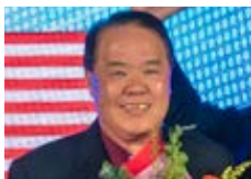
ALKALIZED HEALING WATER SDN BHD (6A2-2 Malaysia)