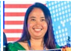
ZION RESOURCES COMPANY (Malaysia)