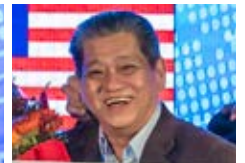
FOLS NETWORK SERVICES (6A2-2 Malaysia)