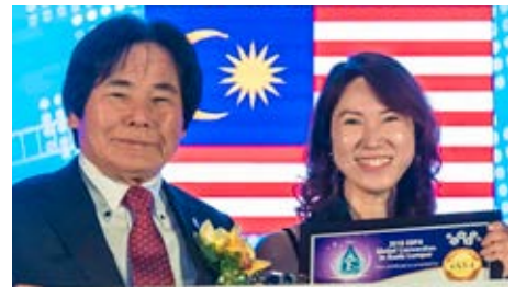
ANK RESOURCES SDN BHD (6A3-4 Malaysia)