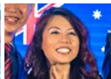
HEALTH FIRST PHARMACY BALLAJURA (Australia)