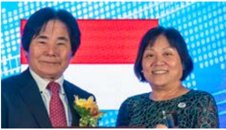
TRUE HEALTH SOLUTIONS PTE LTD (6A2-3 Singapore)