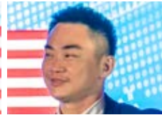
BRICH TRADING (Malaysia)