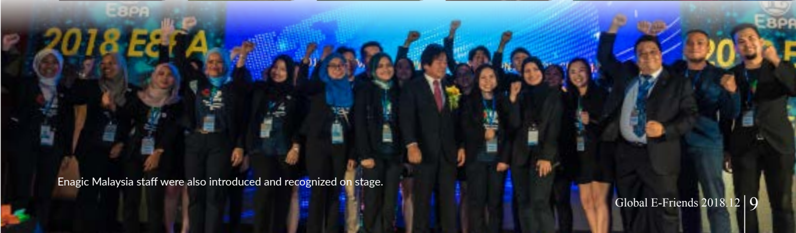
Enagic Malaysia staff were also introduced and recognized on stage.