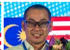
NICE LIVING ENTERPRISE (Malaysia)