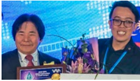
K MARK NETWORK PLT (6A2-3 Malaysia)