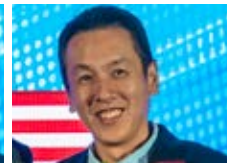
MILAGRO LIFE TRADING (Malaysia)