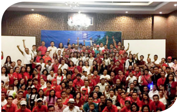
17th September, 2017 in Denpasar