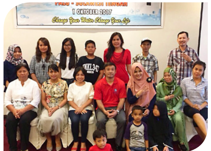
1st October, 2017 in Palu