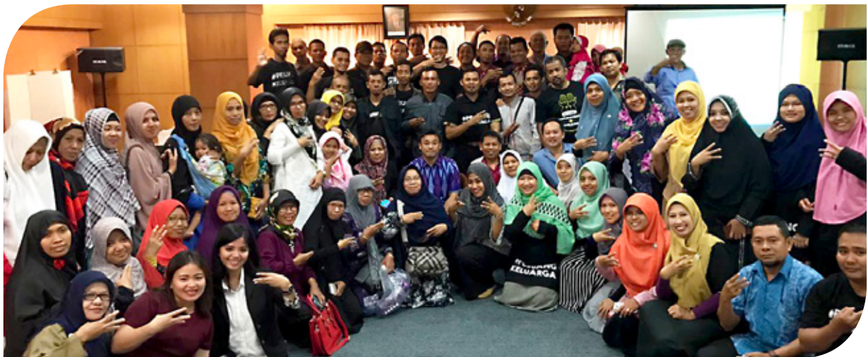
19th August, 2017 in Palembang

At this event, the Indonesia Branch Office provided lunch and a two spray bottle set to each distributor and held a question-and-answer session with staff members about E8PA Cards, 6A Bonuses, and maintenance of the machines. In addition, several distributors spoke about their own success stories and distributors who were promoted to 6A or above were recognized. This was another successful celebration and we look forward to an even bigger celebration next year.