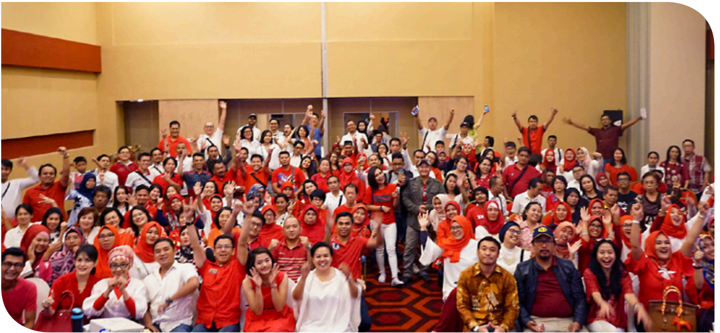
26th August, 2017 in Tangerang