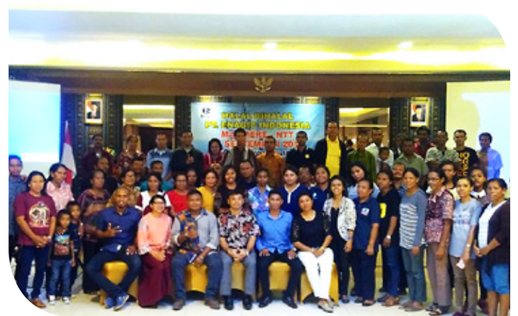
23rd September, 2017 in Maumere