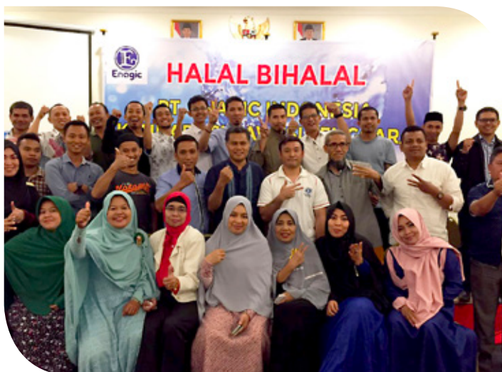
30th September, 2017 in Kendari