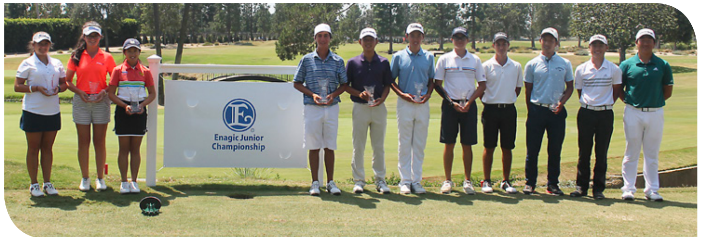
Boys and Girls Winners