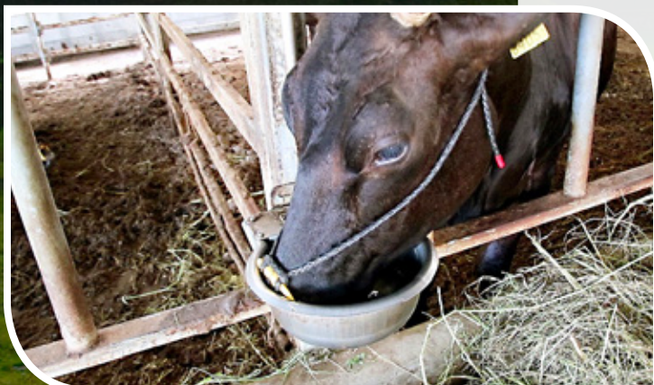
Kangen Water is automatically refilled from the tank into their water bowls.

Our cattle breeding started with only five Kangen-Gyus, which now has increased to over twenty head of cattle. The barn is getting crowded as the cattle grow, and our Kangen Farmers are planning to build an extension. We'll keep you posted with future news and updates, so look forward to more announcements from the Kangen Farm in future issues!