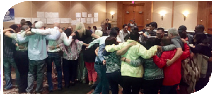
Various exercises help feeling unified.