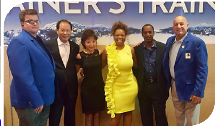
The participants are different nationalities around the world.