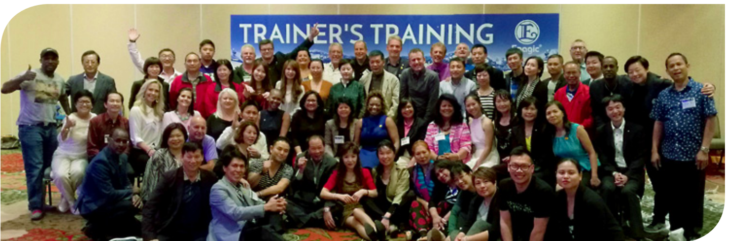
Group photo, "Let's unify!!"