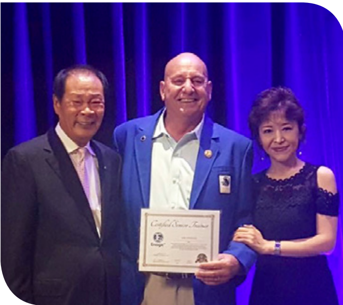
A graduate proudly receives a certificate and gold badge.