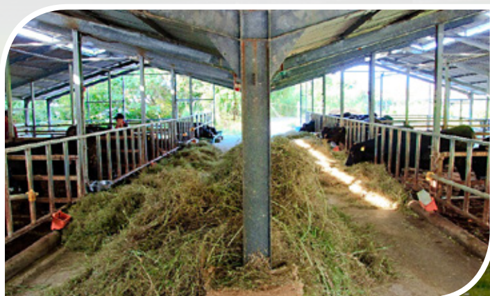
The cattle barn currently stocks over 20 Kangen-Gyus.