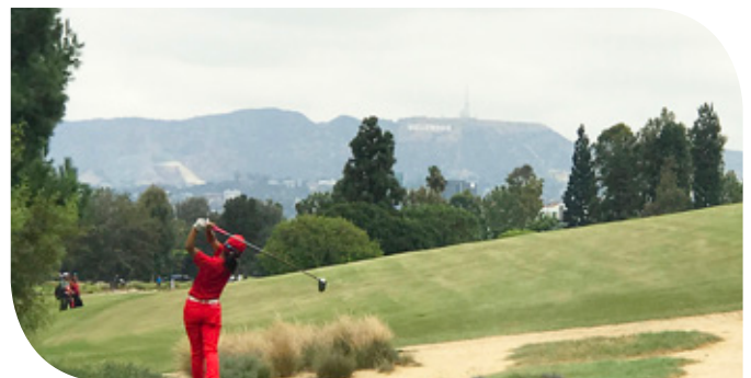
With a view of the Hollywood Sign, a landmark of Los Angeles.